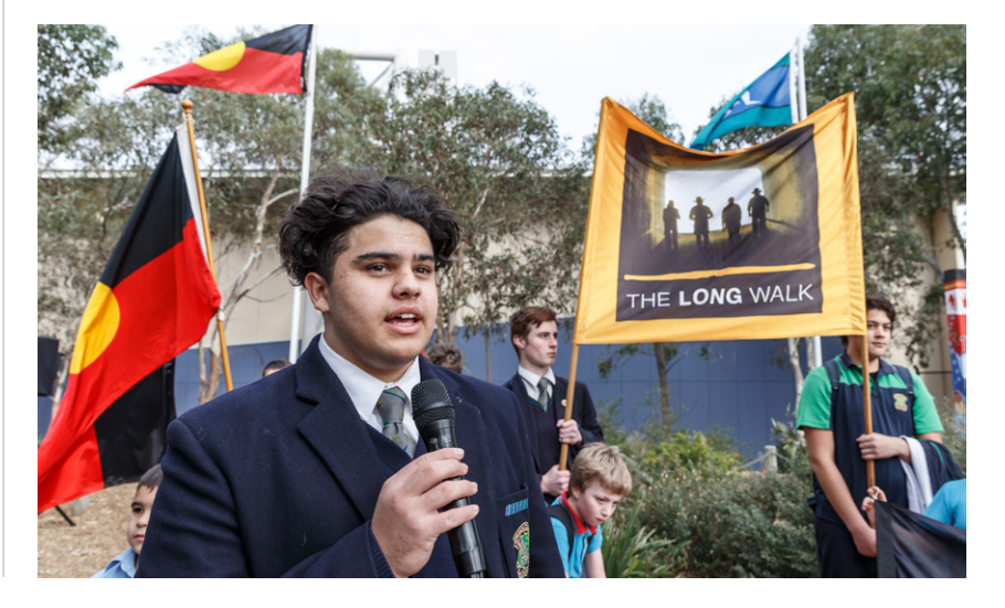
On the path to a just future

Goals of the day were to continue to raise awareness of Aboriginal history and culture, and to consider where schools and society are at in relation to the reconciliation journey.