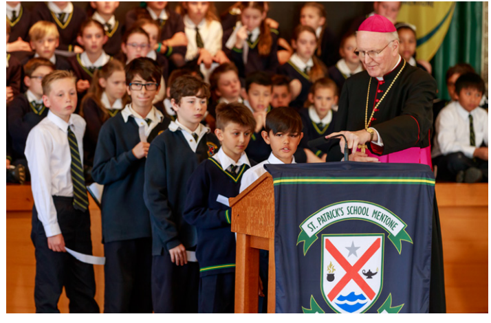
Premier's VCE Awards